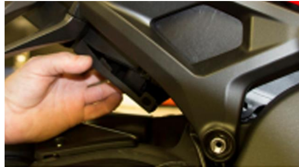
1. Disconnect cable from servo.

Remove plastic servo cover from underside of the tail section.